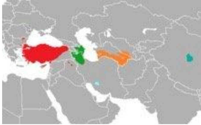
Current distribution of the Oğuz languages

See Ugur Hodoğlugil, “Turkish population structure and genetic ancestry reveal relatedness among Eurasian populations,” Annals of Human Genetics , March 2012, Vol. 76, No. 2, pp. 128-41.