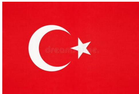
Turkish national flag